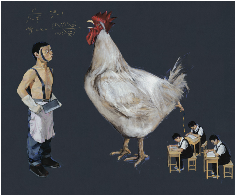
Untitled N.13 , 2009 Pastel on paper 139 x 165 cm