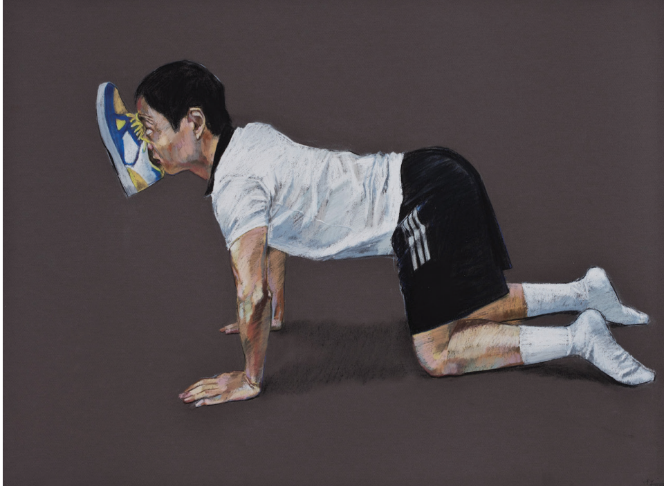
Untitled N.26, 2010 Pastel on paper 55 x 75 cm