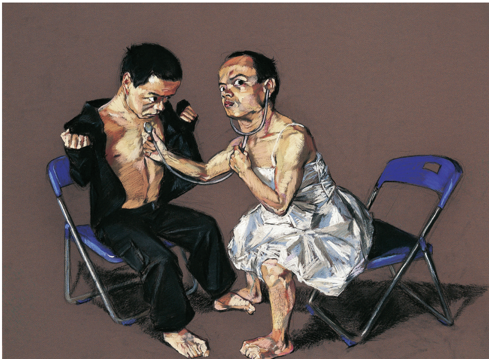
Untitled N.07, 2007 Pastel on paper 55 x 75 cm