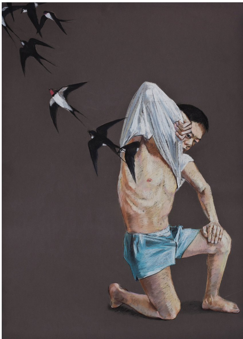
Untitled N.22 , 2010 Pastel on paper 75 x 55 cm