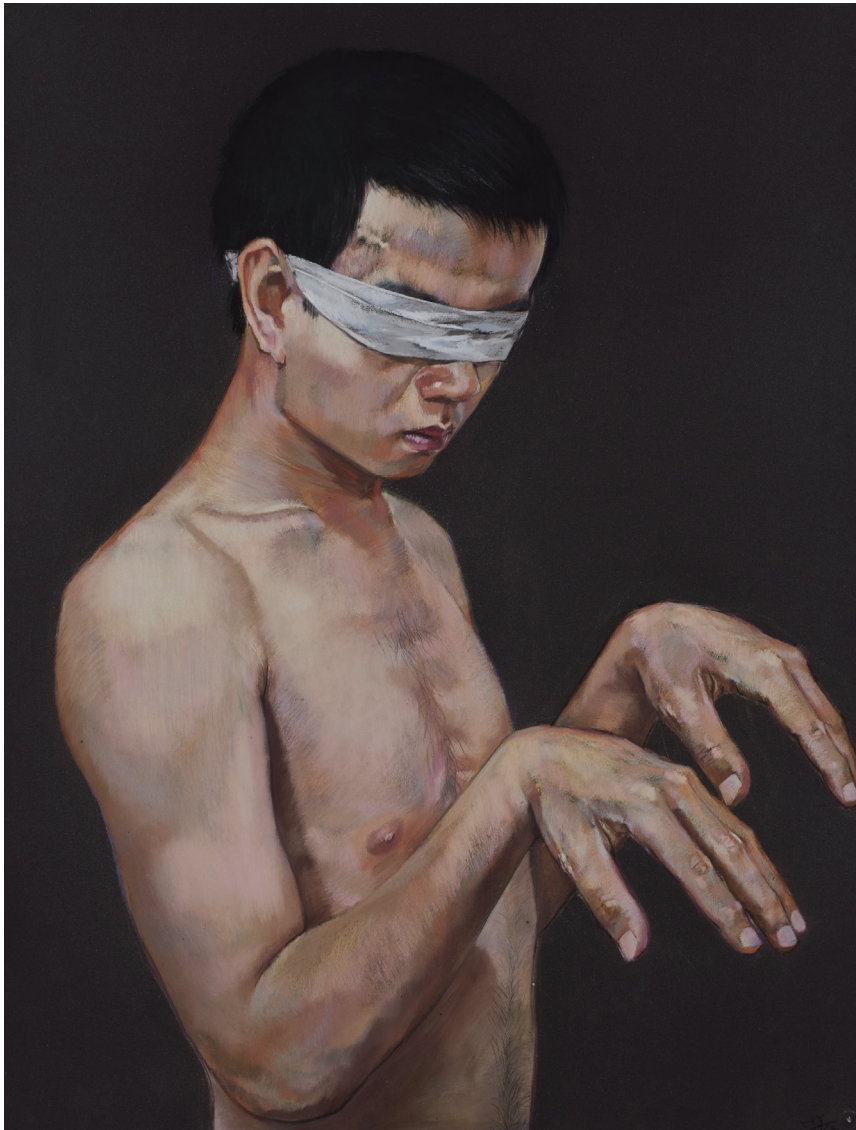
Untitled N.28 , 2011 Pastel on paper 65 x 50 cm