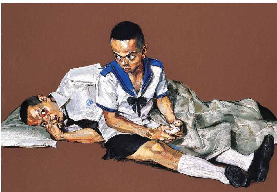
Untitled N.01, 2007 Pastel on paper 75 x 110 cm