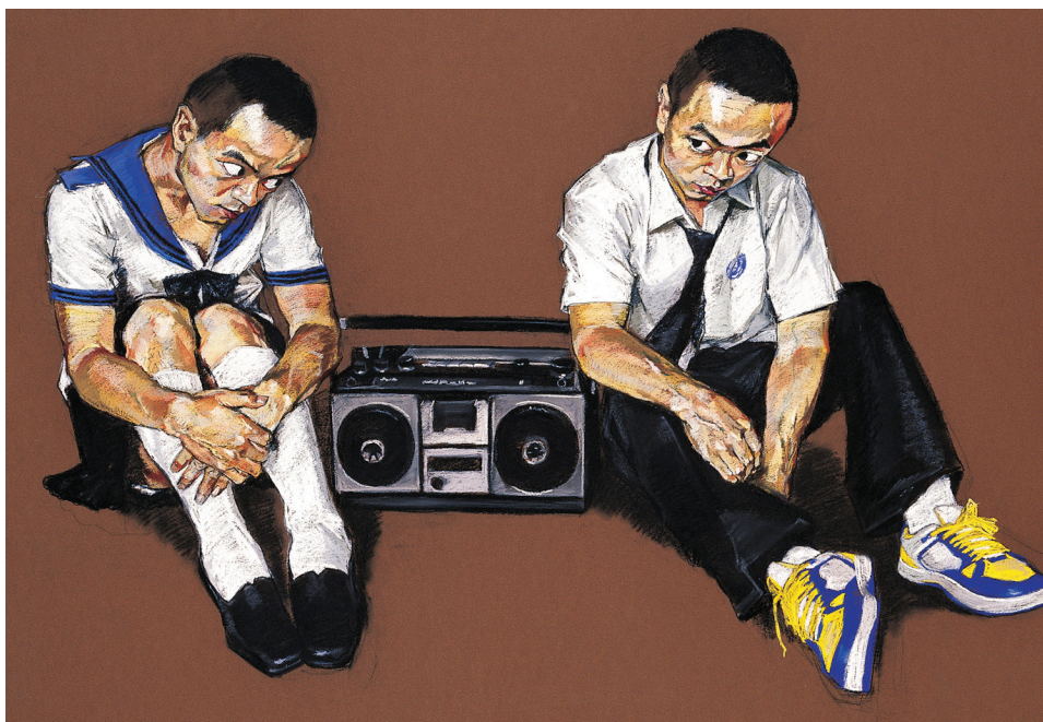
Untitled N.03, 2007 Pastel on paper 75 x 110 cm