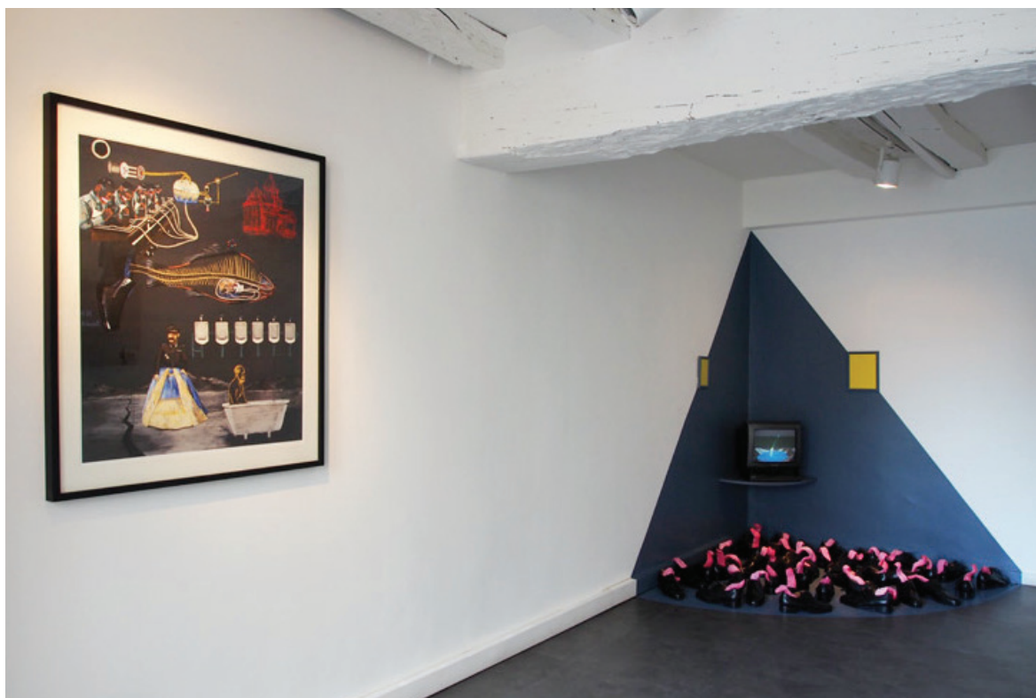
RHIZOMES Solo Show September 12th - November 2nd 2013 Galerie Paris-Beijing, Paris