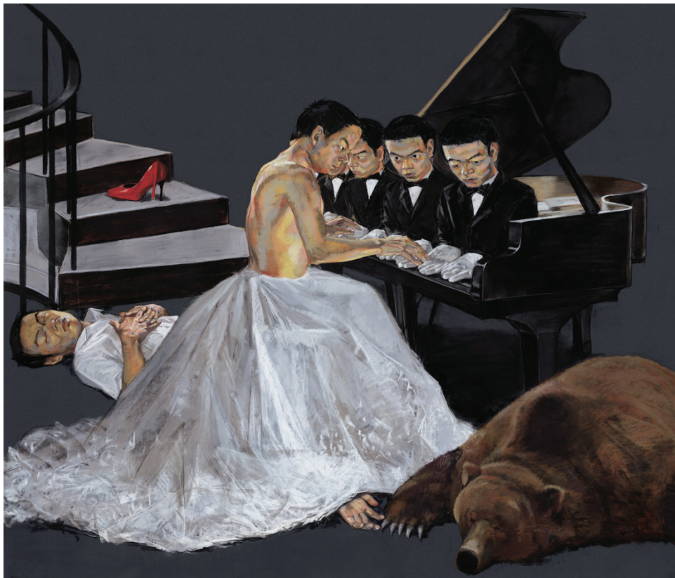
Untitled N.12, 2009 Pastel on paper 139 x 165 cm