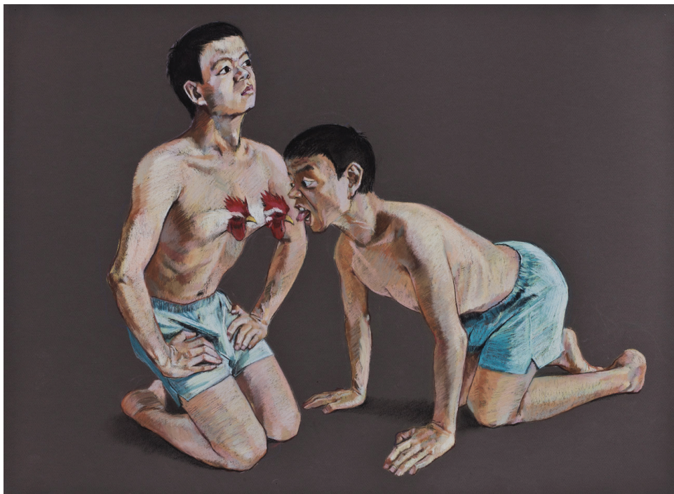
Untitled N.25 , 2011 Pastel on paper 55 x 75 cm