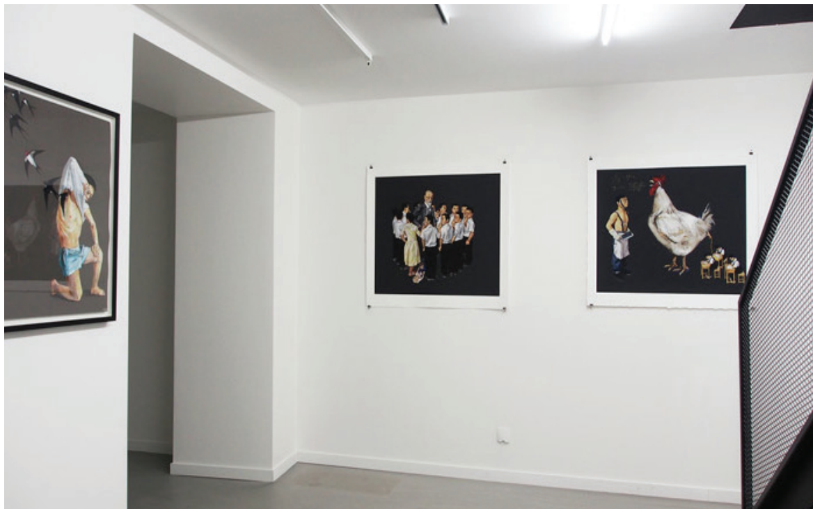
STATE OF MIND PAINTING CHINA NOW June 4th - July 31st 2015 Galerie Paris-Beijing, Paris