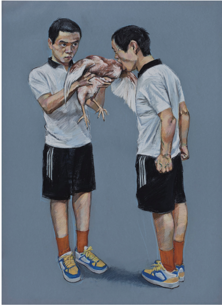
Untitled N.27 , 2011 Pastel on paper 75 x 75 cm