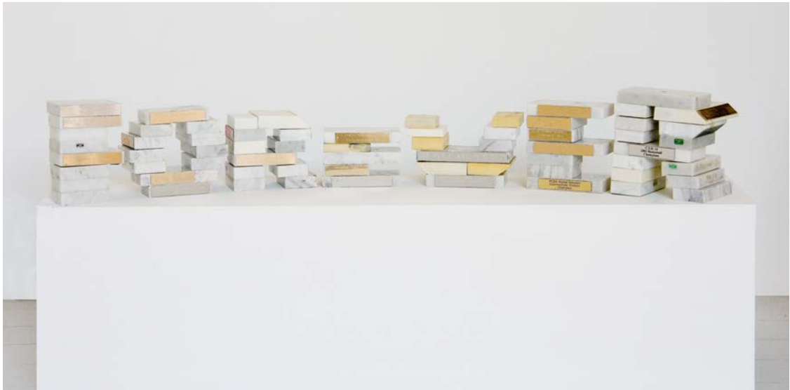
Forever , 2011, 17 x 107 x 29 cm, Marble from discarded trophies