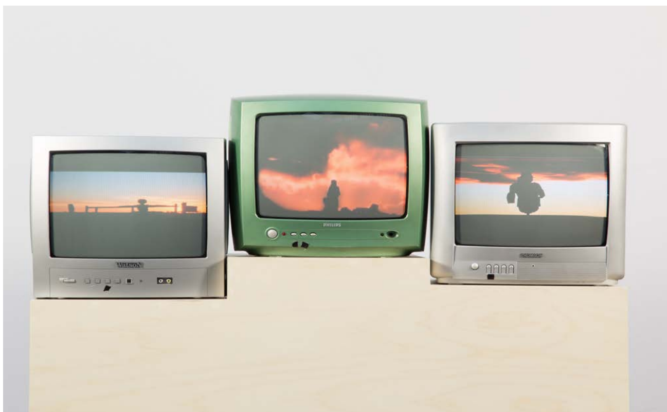
Don't let the sun gown on me from the Day is Done series, 2013, 97 x 111 x 39 cm, Three channel video installation

Day is done is a digital archive of sunset collected from Hollywood films. The sunset are organized by color and subject ans are connected by aligning the horizon line in each film. Sunset is a time of change, a time of hope, and a time of romance. It is the moment when the might takes hold, and the Day is Done.