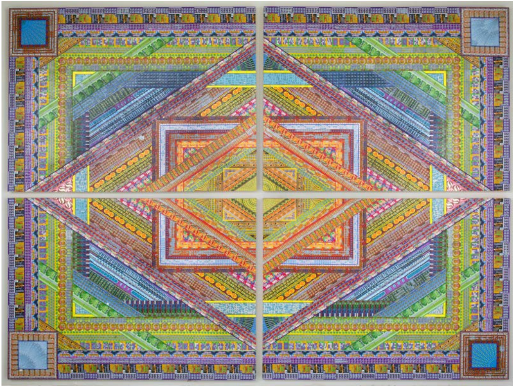
End of spectrum , 2011, 233 x 310 cm, Discarded lottery tickets with UV coat on panel