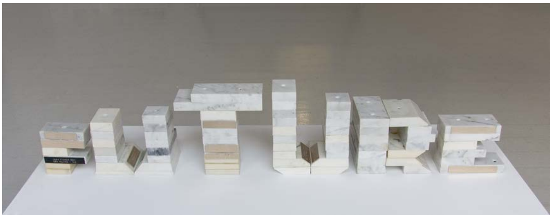
Futur , 2011, 20 x 114 x 17 cm, Marble from discarded trophies