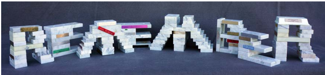
Remember , 2011, 21 x 158 x 32 cm, Marble from discarded trophies