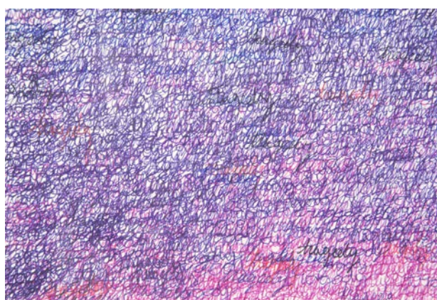
Détails : Tragedy Sunset