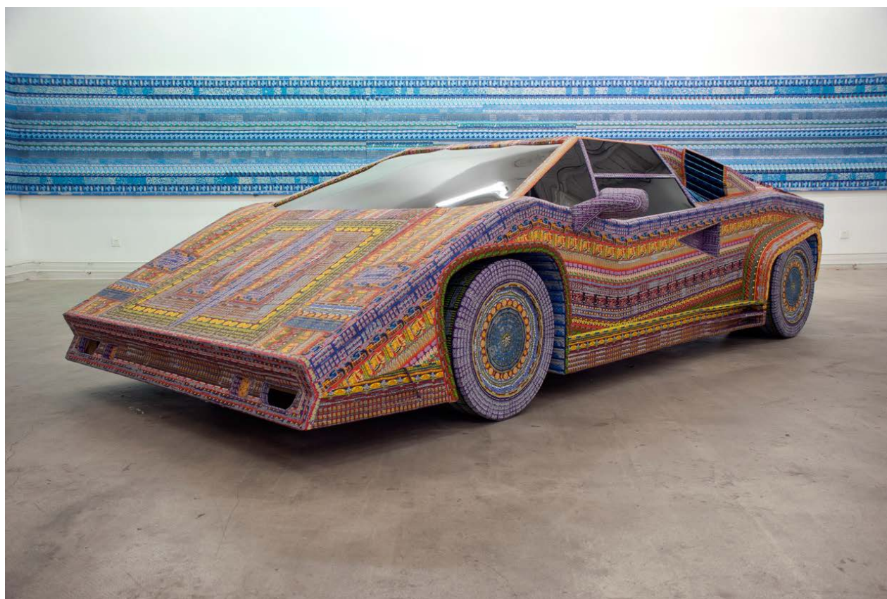
Dream ride, 2010, 110 x 220 x 414 cm, Wood, Plexiglas and discarded lottery tickets with UV coat

Opening on 7 th Saturday February 2015 from 6pm to 9pm