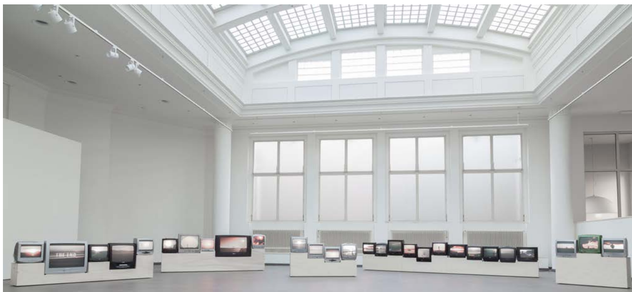
Day is done , 2013, video installation

Day is done is a digital archive of sunset collected from Hollywood films. The sunset are organized by color and subject ans are connected by aligning the horizon line in each film. Sunset is a time of change, a time of hope, and a time of romance. It is the moment when the might takes hold, and the Day is Done.