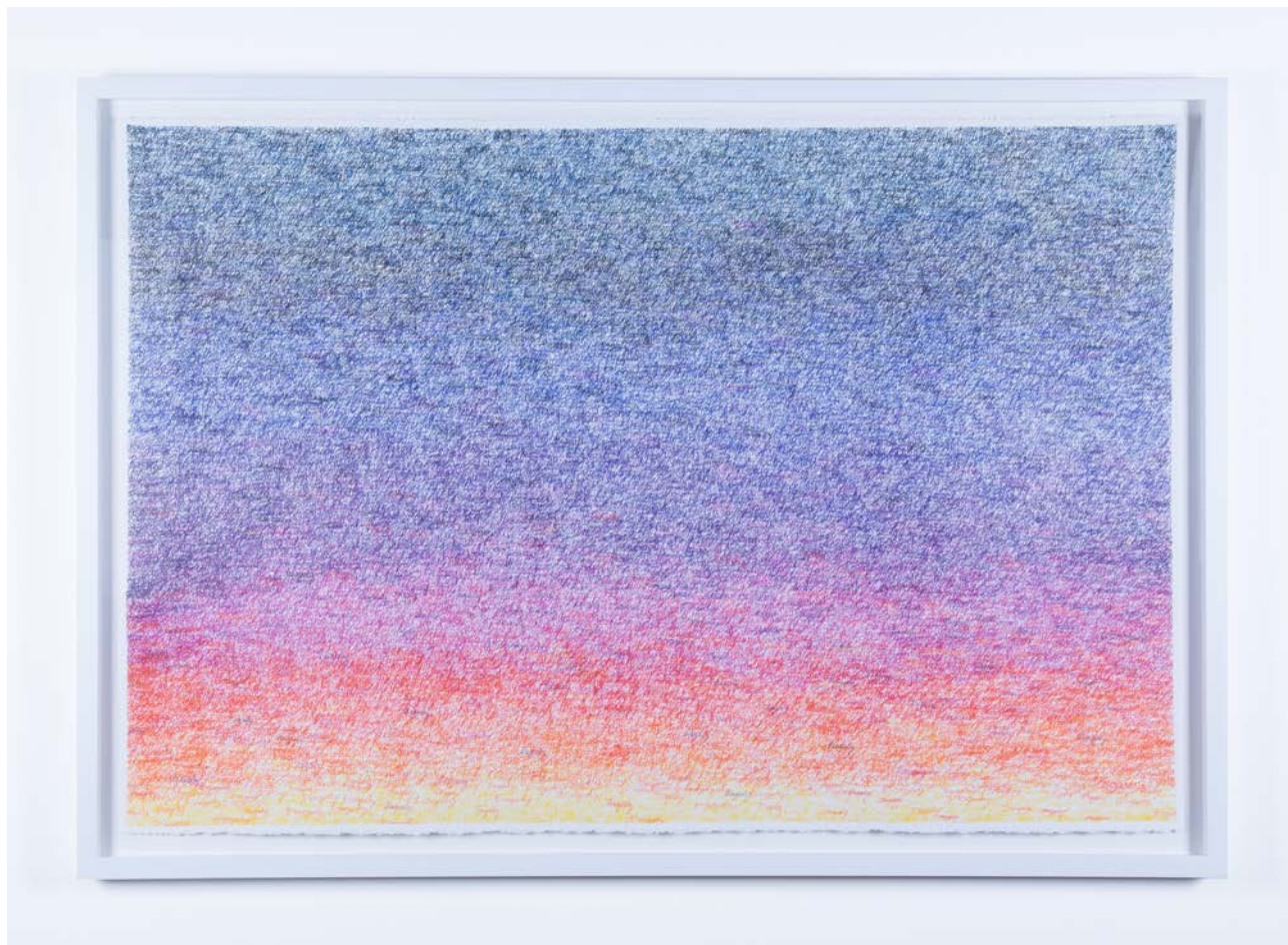
Tragedy Sunset , 2013, 67 x 100 cm, Ink on paper