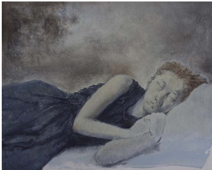
Dream, 2013 Oil on canvas 30 x 50 cm