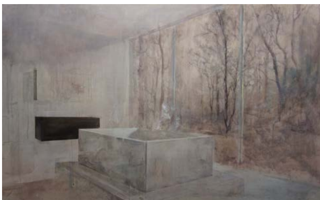
Politicians, Pool scene 2014

Mixed media on paper mounted on canvas 110 x 120 cm