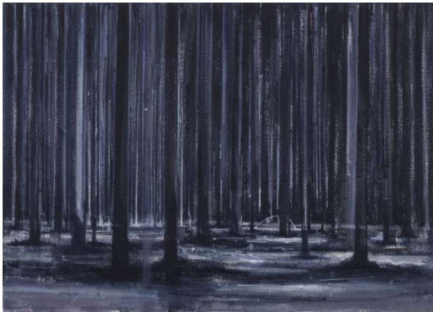
Turbid Landscape, Untitled, 2014 Oil on canvas 50 x 70 cm

Zhu Xinyu fantasizing dive into the twists and turns of landscapes and enchanted forests. His large oil paintings bring the audience between the shadows and glimmers of strange and ethereal twilight passing through the trees. With his hypersensitive work and his interest in mystical ecology, Zhu Xinyu never deals with landscapes romantically, but rather symbolically. If the forest is capable of evoking the relationship between shadows, light and the body, here it is also a place of reminiscence and of meditation, away from the noise of the world.