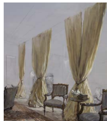
Politicians, Bedroom scene, 2013

Mixed media on paper mounted on canvas 80 x 130 cm