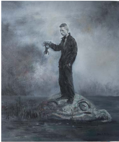
Five elements - Water poisoning, 2012 Oil on canvas 70 x 60 cm

The exploration of the human being and his vicissitudes is the main subject of Sun Yu's works. Using a minimal palette of colors and a polished brush stroke, Sun Yu depicts tormented characters that seem to be searching for the meaning of their own existence. On seeing their face expressions and their fragile silhouettes, we are confronted to feelings of alienation and worry.