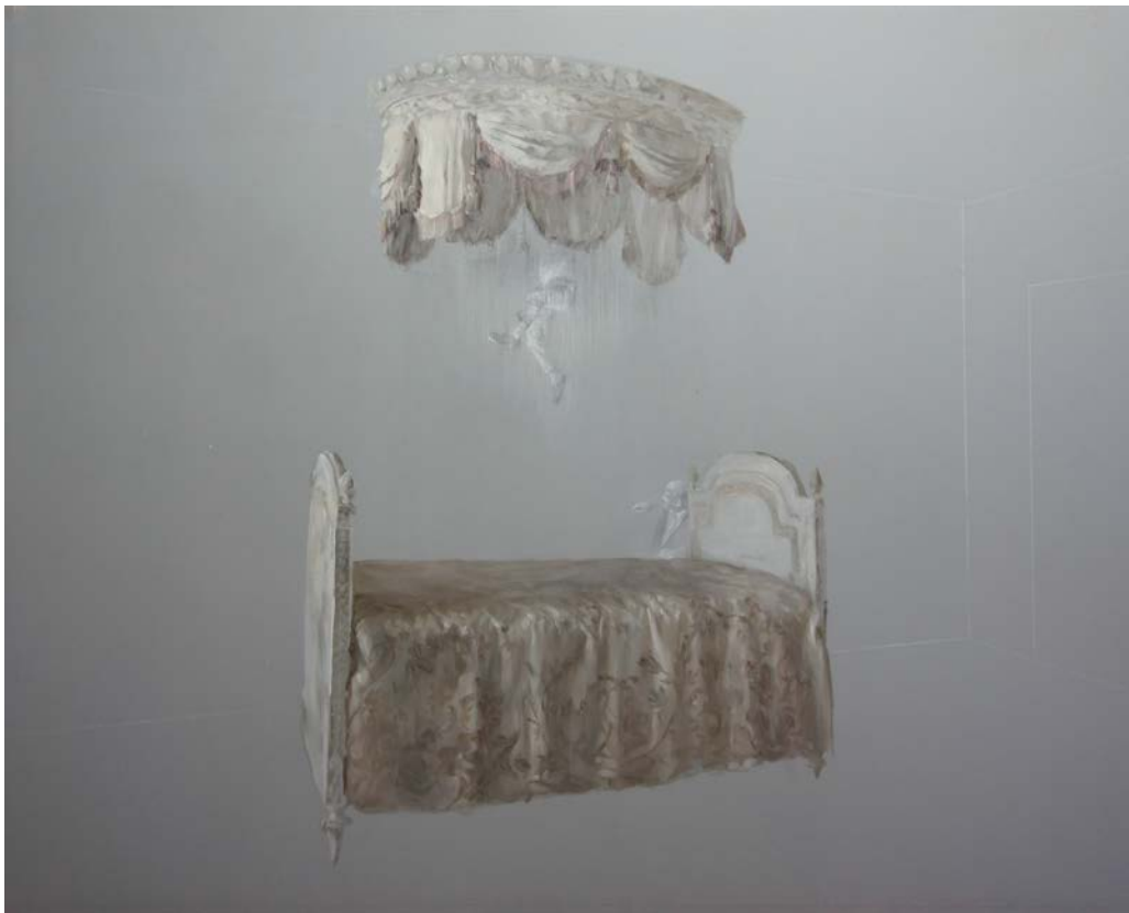
Politicians, Bedroom scene, 2015