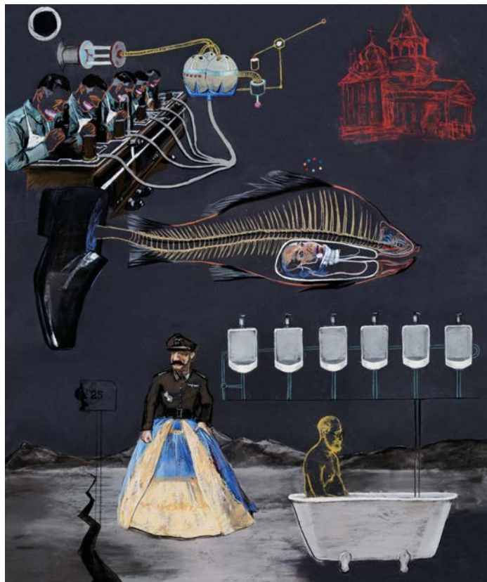
Freud, Fish and butterfly, 2012 Animation video of pastel on paper drawings 03'27"