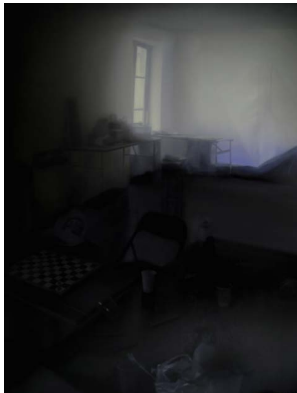
Interiors - School Holidays, 2010 Oil on canvas 170 x 230 cmm