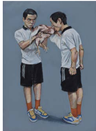
Untitled 02, 2010 Pastel on paper 75 x 55 cm