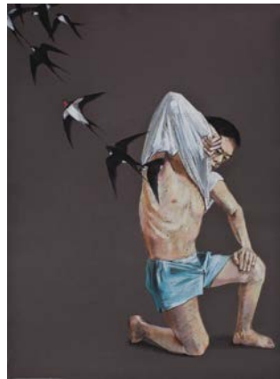
Untitled 22, 2010 Pastel on paper 75 x 55 cm

The work of the painter and video artist Wang Haiyang addresses more explicitly the states of the subconscious and explores the most tortuous relations it entertains with desires. His Kafkaesque characters transform and metamorphose, while enigmatic images put us face to face with disturbing emotions. The sky's the limit for the creations of the unconscious in the fantasy works of Wang Haiyang, as illustrated, for example, by the figure of Freud whose skull opens up to release butterflies ( Freud, Fish and Butterfly , 2012).