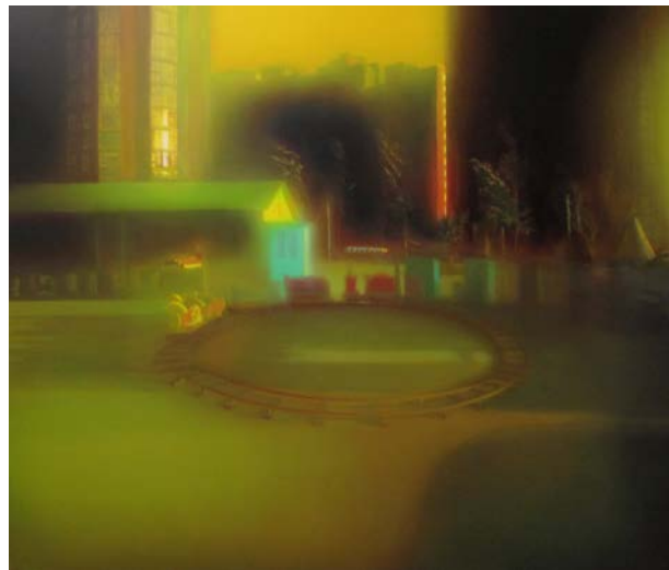
Gardens, Edge of the City, 2012 Oil on canvas 170 x 200 cm

Light is the primordial element in the Ma Sibó canvases, also. Plays of light and haziness, obtained by an astonishing manipulation of his materials in gradation, create a troublingly strange effect that blankets the banal scenes and spaces, such as merry-go-rounds in a theme park or clothing abandoned in the half-light of a bedroom. In these places, purged of all human presence, sensations are elicited by things and colors. Indeed, Ma Sibó's brushes envelope inert objects with an emotional aura, awakening distant memories and a vague nostalgia.