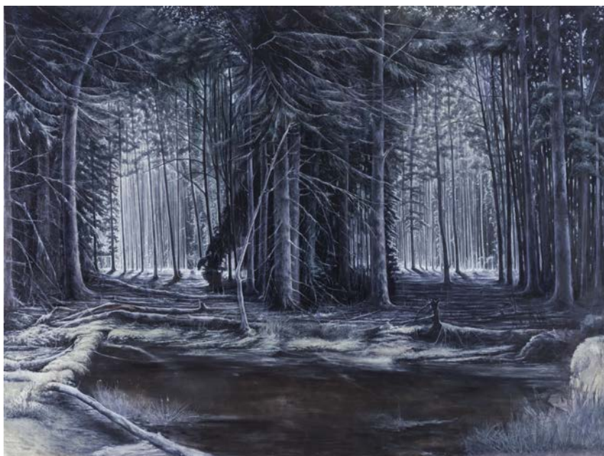
Turbid Landscape, Grace, 2014 Oil on canvas 240 x 320 cm