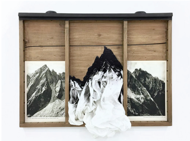
© Lucia Tallová, Mountains , 2018 / courtesy Galerie Paris-Beijing

PBProject welcomes the first solo exhibition in France of Lucia Tallová, leading figure of the emergent Slovakian art scene. Born in 1985, she lives and works in Bratislava.