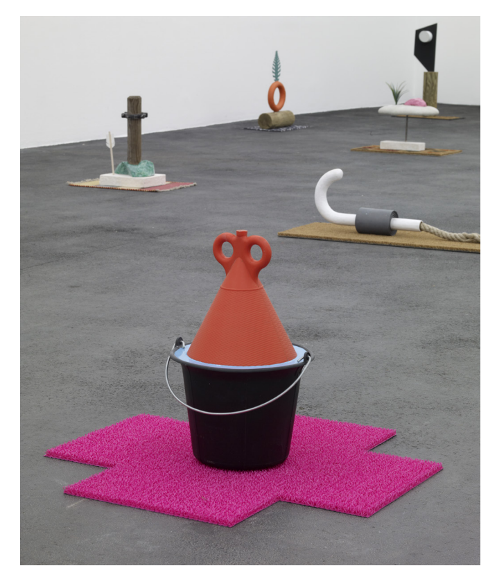
"Pagliacci" series in the exhibition "Tailles Douce", CRAC de Sète, 2014.

The exhibition will propose a significant set of sculptures of different sizes, arranged on the ground or leaning on the walls, a path composed of recent works made for the most part in the last three years, such as the series of "Patères" or "Pagliacci". They will dialogue with unpublished works produced for the occasion including that of "Samplers" made of fragments from the background of the studio, remnants of abandoned projects that make up a repertoire of forms in the artist's inimitable style, between zaniness and derisory poetics, between narration and references to the works of Spoerri or Rauschenberg.