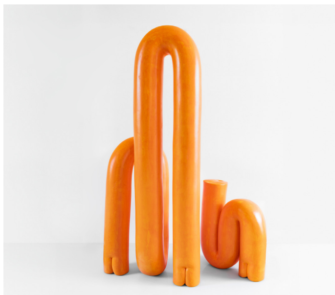
Série « Body Schema », The Rhythm of Codependence on a Single Orange Note , 2022, 170 x 100 x 4 cm, Jesmonite, fibre de verre, pigment

The exhibition at PARIS-B, the artist's first solo show in France, explores both the beauty and the complexity of a queer body in its relation to systemic identity. Filled with references to the human body and the clinical universe, the gallery becomes a giant anatomy that Magyarlaki jostles and dissects to make visible what underlies our internal architecture: a body in perpetual deconstruction.