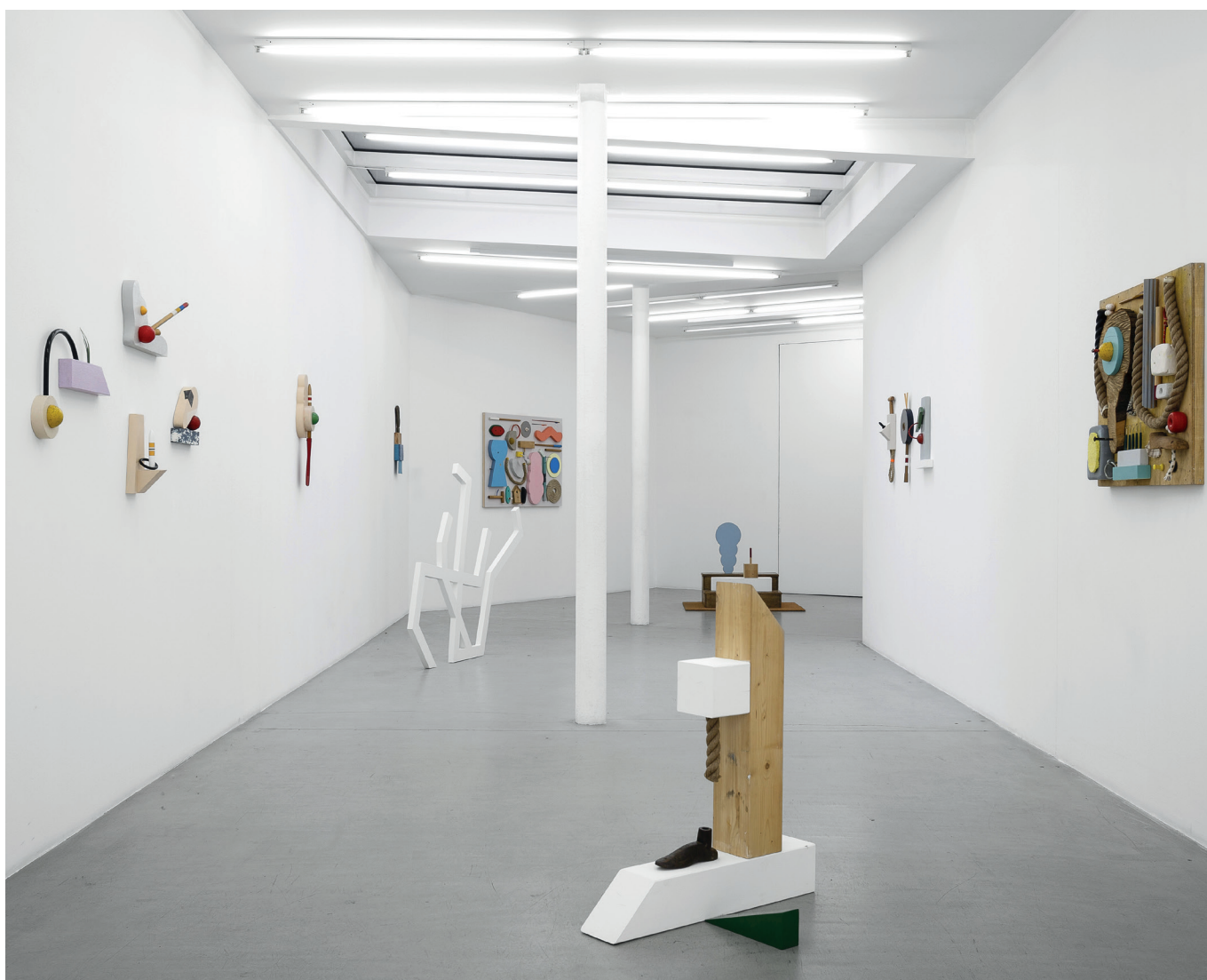
Exhibition view « 55 », PARIS-B, Paris, 2022